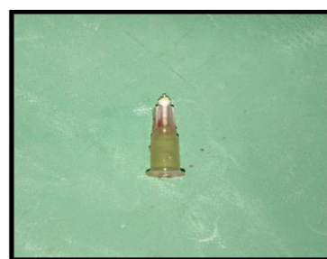
Figure 5: (syringe hub)