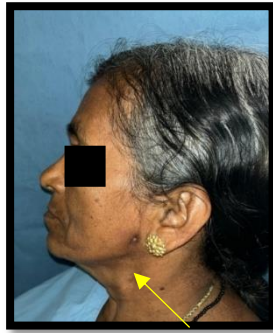
Figure 1: Clinical Photograph

On examination, the maximum interincisal opening was approximately 25 mm. No deviation or deflection of the jaw was observed on opening and closing. There was no tenderness of the temporomandibular joint (TMJ). Palpation revealed no swelling or tenderness along the masticatory muscles.