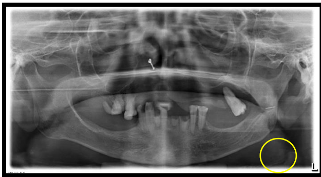
Figure 2: OPG (Preoperative Radiograph)

Routine preoperative investigations, including Viral markers and coagulation profile, are done. 2,3 All the values are normal and within the range. A panoramic radiograph of the mandible showed a linear, slender radio-opaque-like structure extending from the anterior border of the ascending ramus to the posterior border in a near-horizontal plane in which outline was regular and consistent (Figure 2).