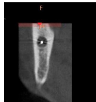
Figure 3: CBCT (sagittal view)

The diagnosis was challenging due to the patient's vague surgical history and the delayed onset of symptoms, almost a decade after the initial procedure. The nonspecific nature of pain and sinus tract further complicated clinical suspicion, necessitating imaging for definitive diagnosis. CBCT sagittal section confirmed the presence of a radiopaque structure with sharp borders measuring approximately 1.5 cm in length, surrounded by radiolucency (Figure 3). It was centrally located between the medial and lateral borders, but with no signs