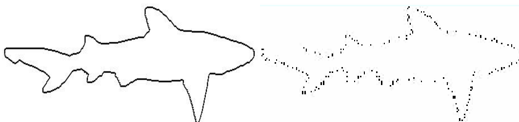
Fig-3: Illustration of the WTMM image (a) Original image (b) Its WTMM image

In general, either the complexity of the above algorithms increases exponentially as the number of candidate images increases.