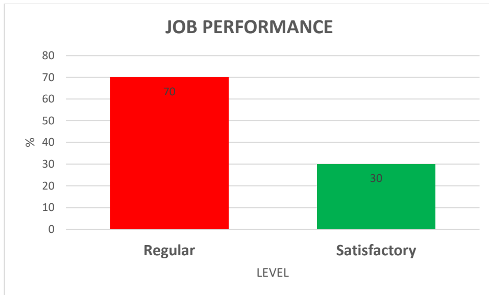
Fig. 2. Work performance (BEFORE)