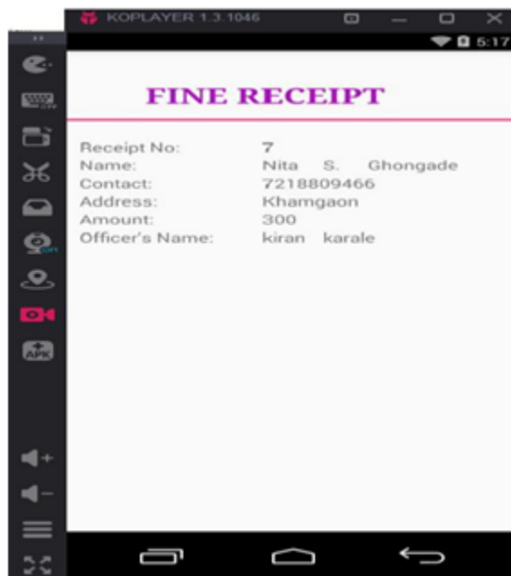
Figure: fine Receipt

Fine receipt: This is the last step for if person is not having driving license then it pay the fine amount through bank accounts or any other option are also available to pay the amount. In fine receipt there also option for person for payment like cash payment, or online payment.