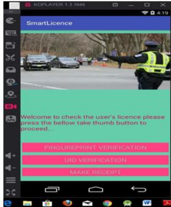
Figure: Verification Mode

Fine receipt: This is the last step for if person is not having driving license then it pay the fine amount through bank accounts or any other option are also available to pay the amount. In fine receipt there also option for person for payment like cash payment, or online payment.