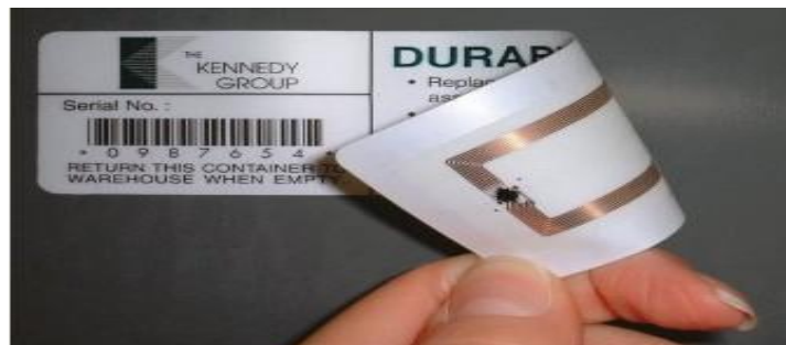
Figure 4. RFID Tag [16]