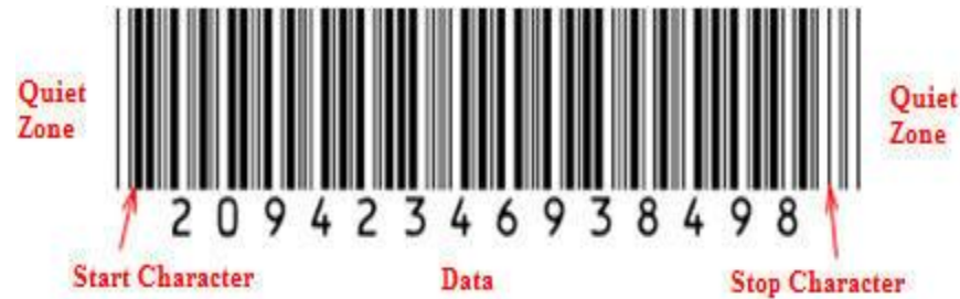
Figure 3. Structure of Barcode [15]